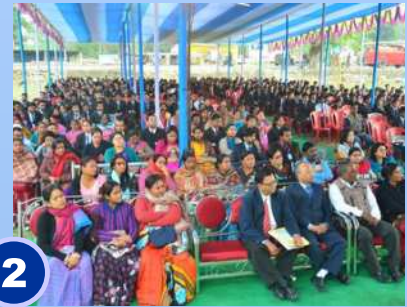
2 Adoption of village under the Project on Legal AID and Awareness.