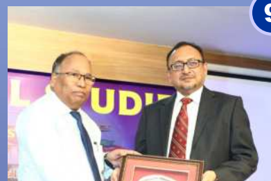
9 The Hon'ble Justice MD.Rezaul Hasan, Judge, High Court Division, The Hon'ble Supreme Court of Bangladesh at the International Conference on Displacement Justice.