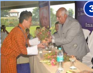
3 National Symposium Presided by Hon'ble Justice B. Samadder & Hon'ble Justice Soumen Sen.