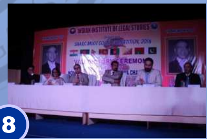
8 Inaugural Ceremony of SAARC MOOT Court Competition.