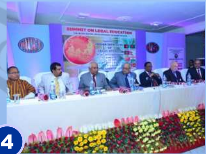
4 Summit on Legal Education in SAARC Region.