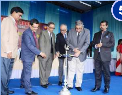
5 Consumer Lok Adalat organised in collaboration with the State Legal Service Authority, West Bengal.