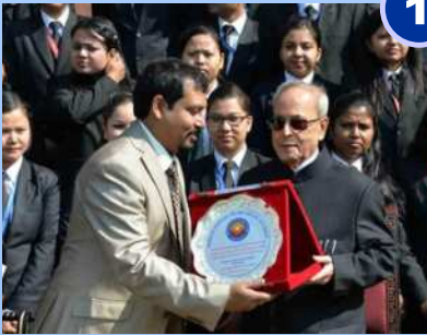
1 His Excellency Late. Shri. Pranab Mukherjee, Former President of India at Rastrapati Bhavan, New Delhi.