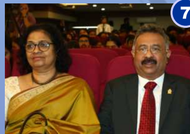
7 The Hon'ble Chief Justice Jayantha Chandrasiri Jayasuriya, The Hon'ble Supreme Court of Sri Lanka at the International Conference on Displacement Justice.