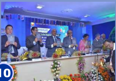
10 SAARC Law Conclave on Legal Education and Practice : The Emerging Trends and Remedies.