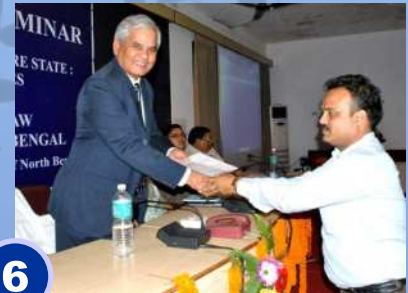
6 UGC National Seminar on "Social Justice & Welfare State: Myth & Realities".